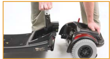
Step 3: Push apart the frame!