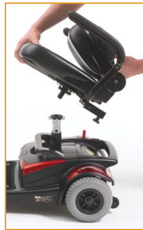
Step 1: Pop off the seat!