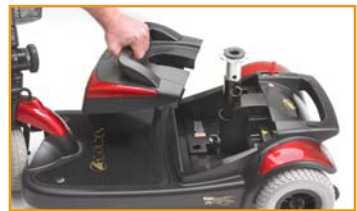
Step 2: Pull off the battery pack!